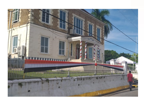
St. Ann Parish Court was second runner-up in the Best Theme category.