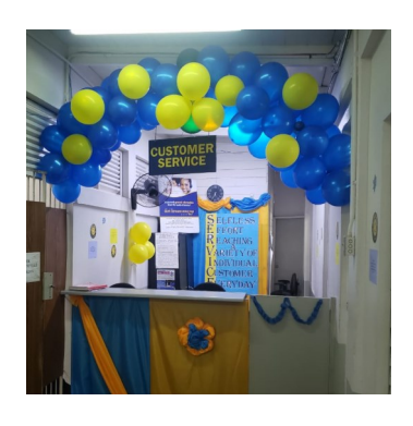
St. Mary Parish Court received Special Recognition in the Best Theme category.