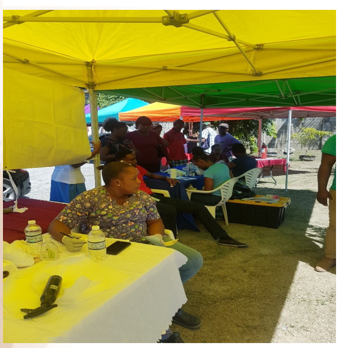
Residents and staff at the St. Thomas Health Fair on November 29, 2019.

Staff members at the St. Thomas Parish Court and residents of Morant Bay benefitted from a Health and Wellness Fair on November 29, 2019.