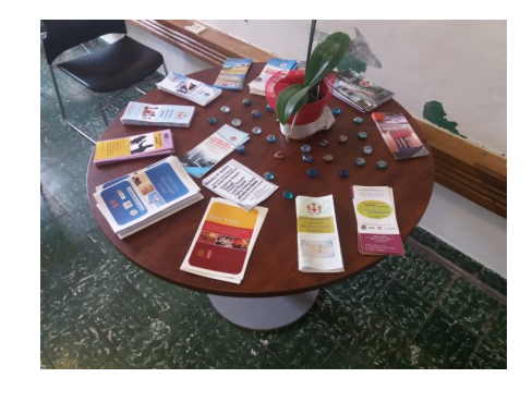
St. Catherine Parish Court won in the Best Public Education Corner category.