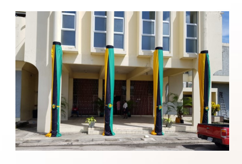
Hanover Parish Court was among the courts awarded in the Creativity category.