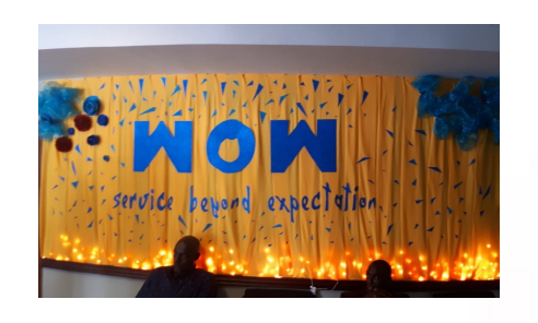
Supreme Court was awarded in two categories: Best Public Education Corner and Creativity.