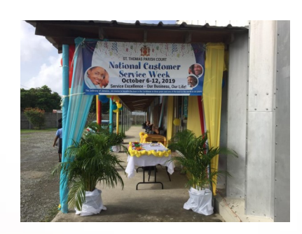
St. Thomas Parish Court was among the courts awarded in the Creativity category.