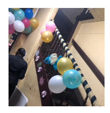
Manchester Parish Court won the Best Theme category.